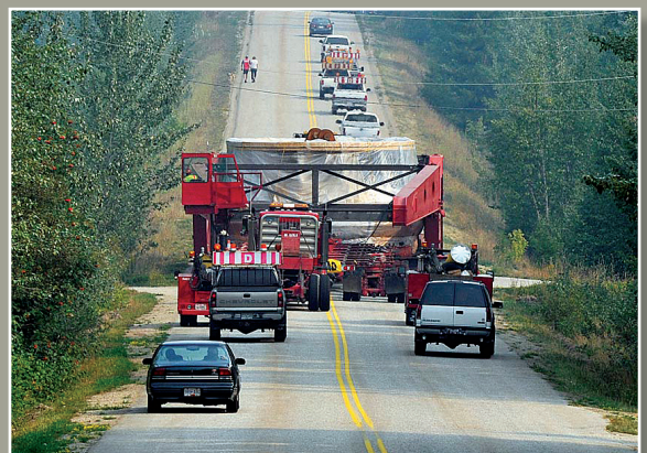
▶ Today, Guy Tombs Limited specializes in the movement of project, breakbulk and military cargoes.